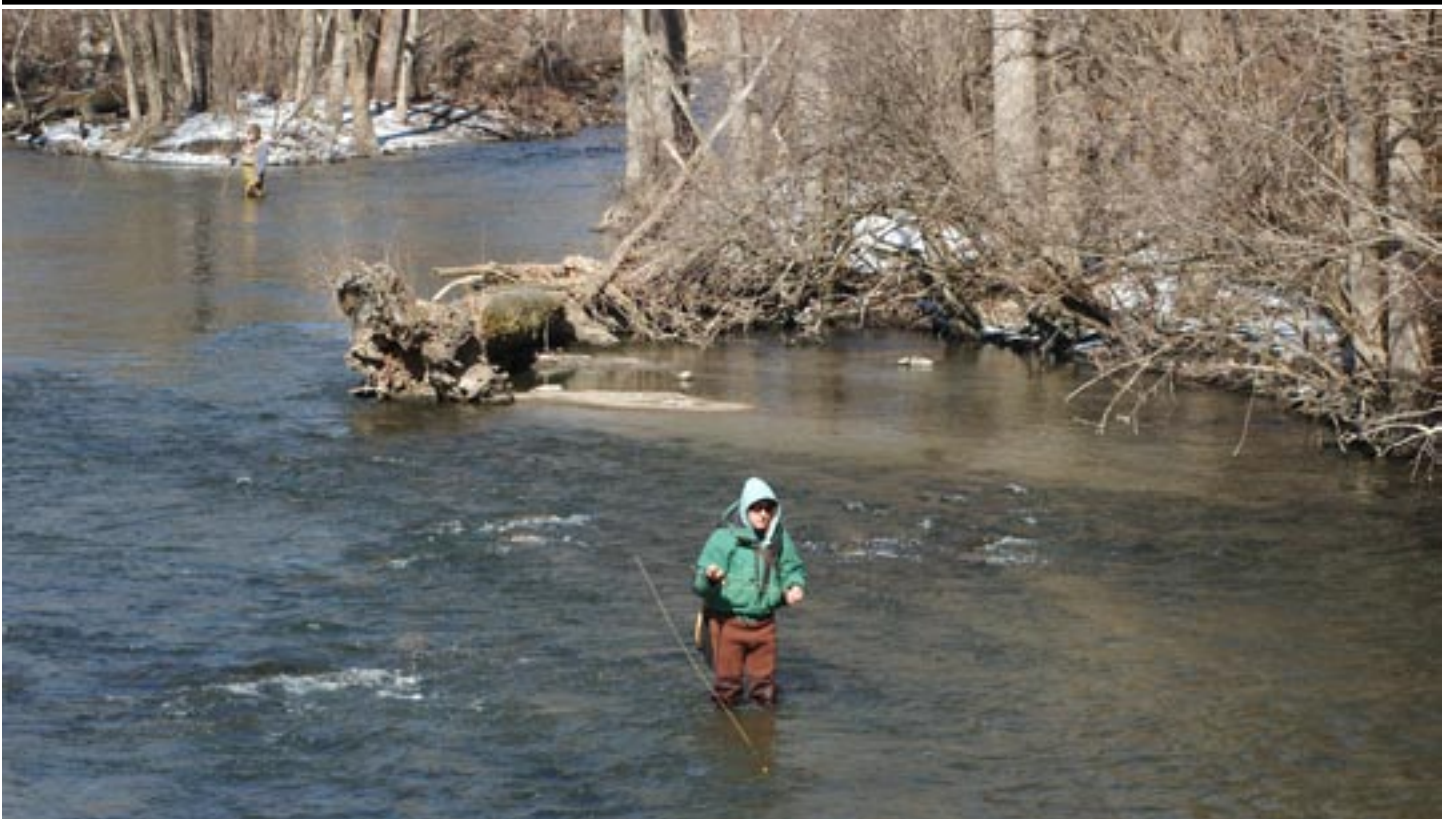
Early spring pre-season action on the Pequest River. Don't forget Opening Day is April 8th!